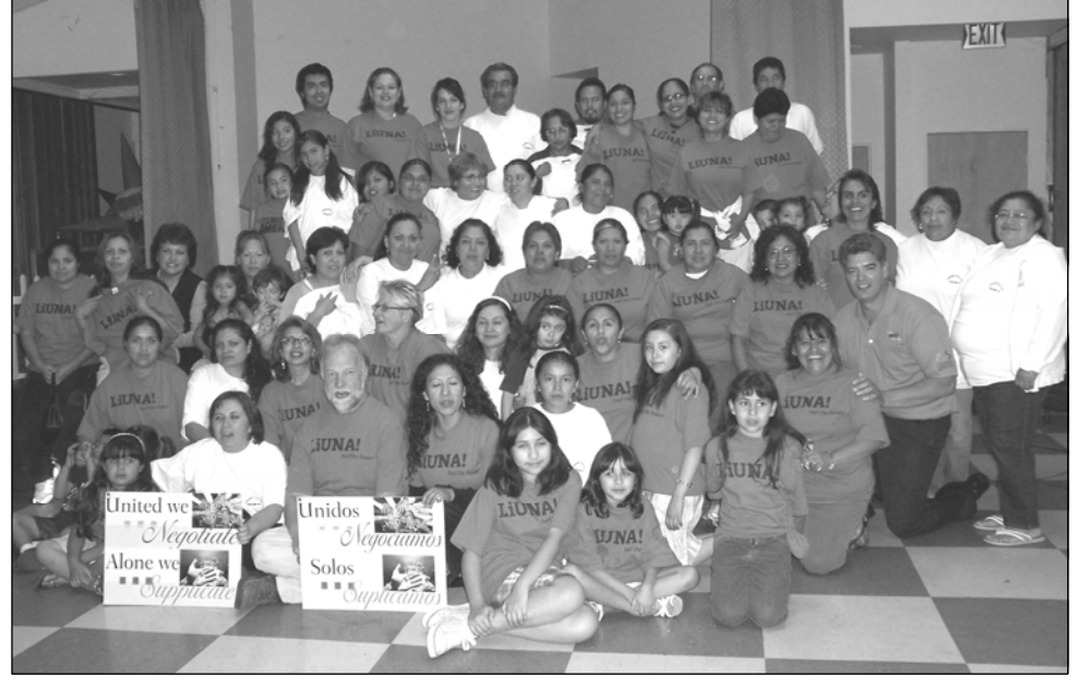
New union members from the Washington County Oregon Child Development Coalition join fellow activists from Laborers Local 320 to celebrate their landslide victory after winning the union election 124-17.