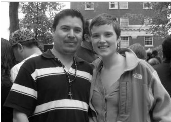
Read the stories of our clients and our work to support them inside.

in wages & damages for low wage workers!