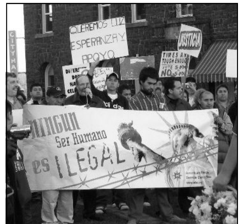
Columbia County, Oregon

If you sign the Defend Oregon Pledge online, you will let the coalition know that you believe corporations should pay more than $10 a year in income taxes and that you want to protect Oregon's essential services.