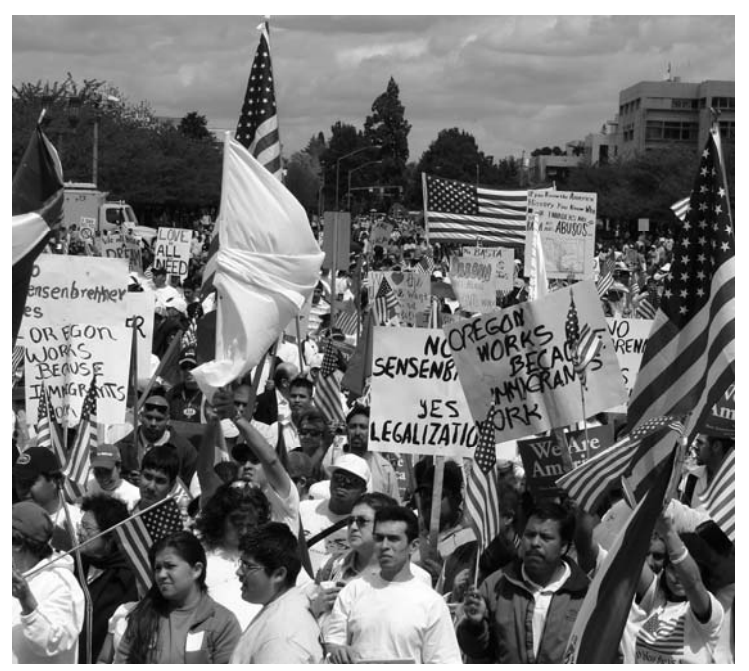
May 1 March for Immigrants' Rights, Salem Oregon

At its best, the work of NWJP may, in whatever humble ways, help to inspire future champions in the cause of equal rights and social justice.